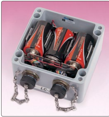
● Model 8003A-1 MEMS Datalogger shown with cover removed.