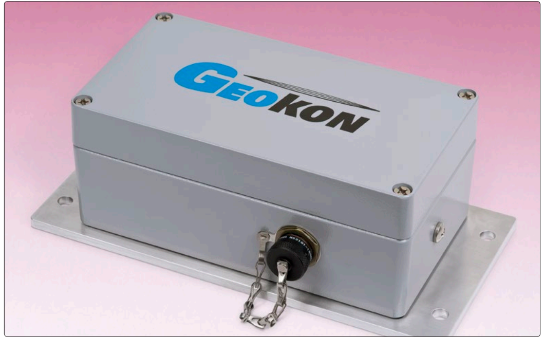
• Model 8003C-2 MEMS Datalogger.