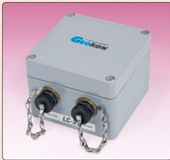
• Model 8003A-1 MEMS Datalogger.