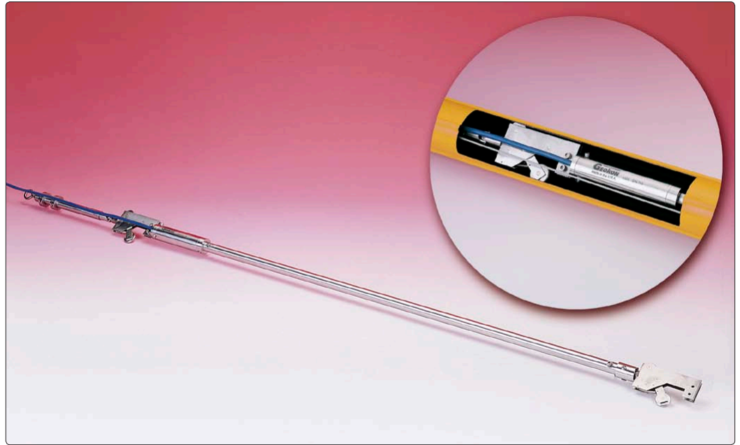
• Model 6155 MEMS Horizontal In-Place Incliner. Inset photo reveals installation detail with a section of the Model 6500 Incliner Casing removed.