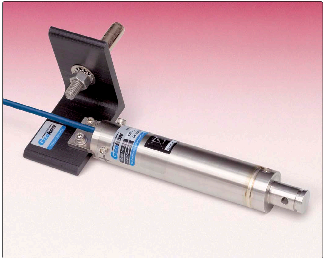
• Model 6350 Vibrating Wire Tiltmeter shown with mounting bracket assembly.