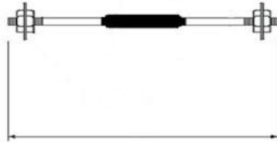
5/16" Diameter by 8" Long Sensor

Because of their low profile design, these sensors can be used in concrete pavements, columns, walls, bridge elements or wherever dynamic strains need to be measured.