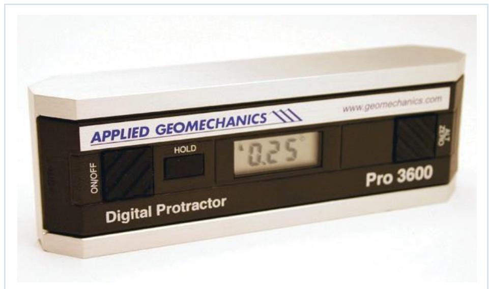
Pro 3600 Digital Protractor

at the top and bottom surfaces of the instrument. The top and bottom surfaces are parallel to within ±0.005 inch (±0.1mm). A V-groove runs the length of the bottom surface for easy placement on curved surfaces such as pipes or tubes. There are two threaded mounting holes in the bottom of the Pro 3600 for fastening to a mounting surface with screws.