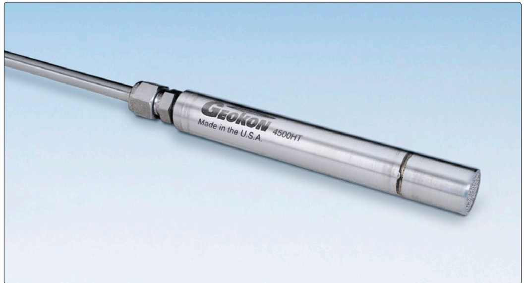
• Model 4500HT High Temperature Vibrating Wire Piezometer.

• Model 4500HT used for monitoring pressures and temperatures in oil recovery applications.