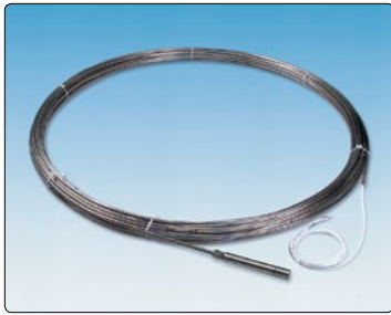
• Model 4500HT shown with Teflon® cable inside stainless steel tubing (coiled, pre-installed configuration).