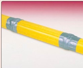
• Close-up shows two sections of the Model 6500 riveted and taped together with a standard length coupling.