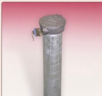
• Model 6501-6-2 Inclinometer Casing Protective Housing, 4" galvanized steel pipe with lockable cap.