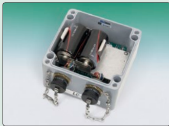
● Model 8002-1A-1 (LC-2A).