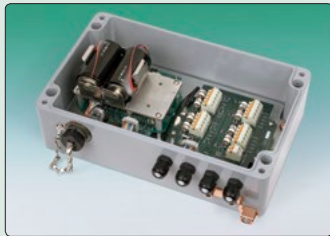
● Model 8002-4-1 (LC-2x4).