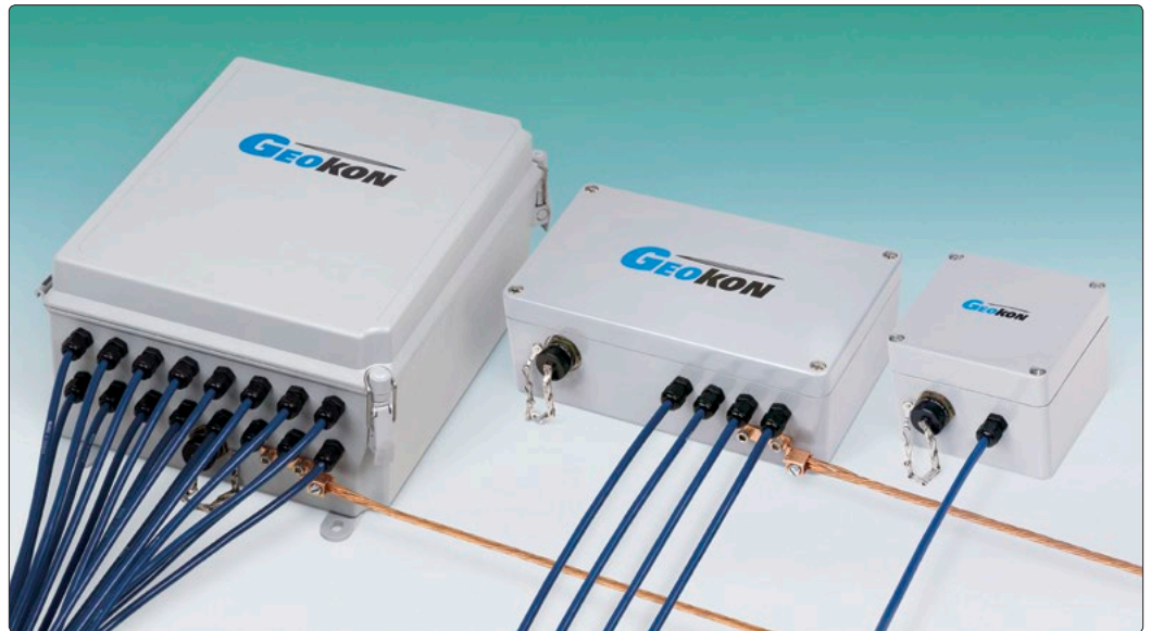
● Model 8002-16-1 (LC-2x16) 16-Channel, Model 8002-4-1 (LC-2x4) 4-Channel and Model 8002-1-1 (LC-2) Single-Channel Dataloggers.