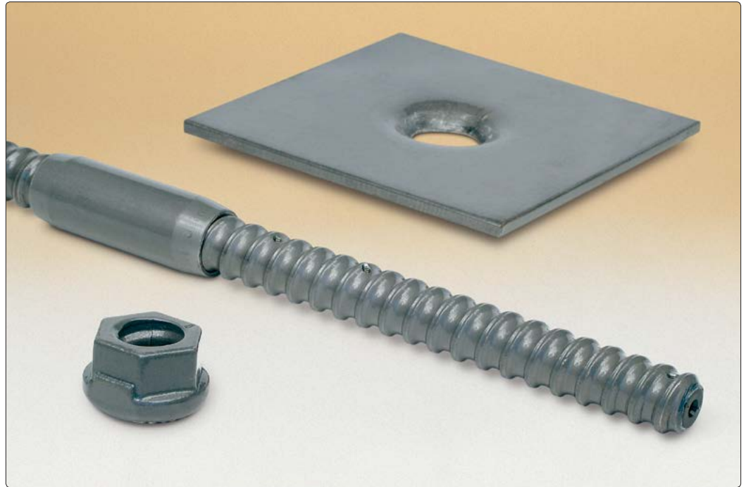
• Model 4910 Instrumented Rockbolt components (front to back: nut, rockbolt and mounting plate).