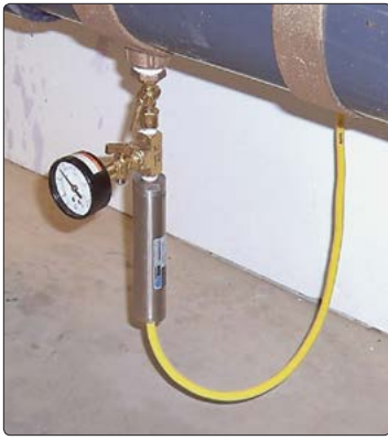
• Model 3400H and Dial Gauge Pressure Transducer on a tee fitting.