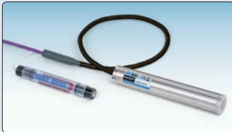
• Model 3400SV-1/2 Semiconductor Vented Piezometer.