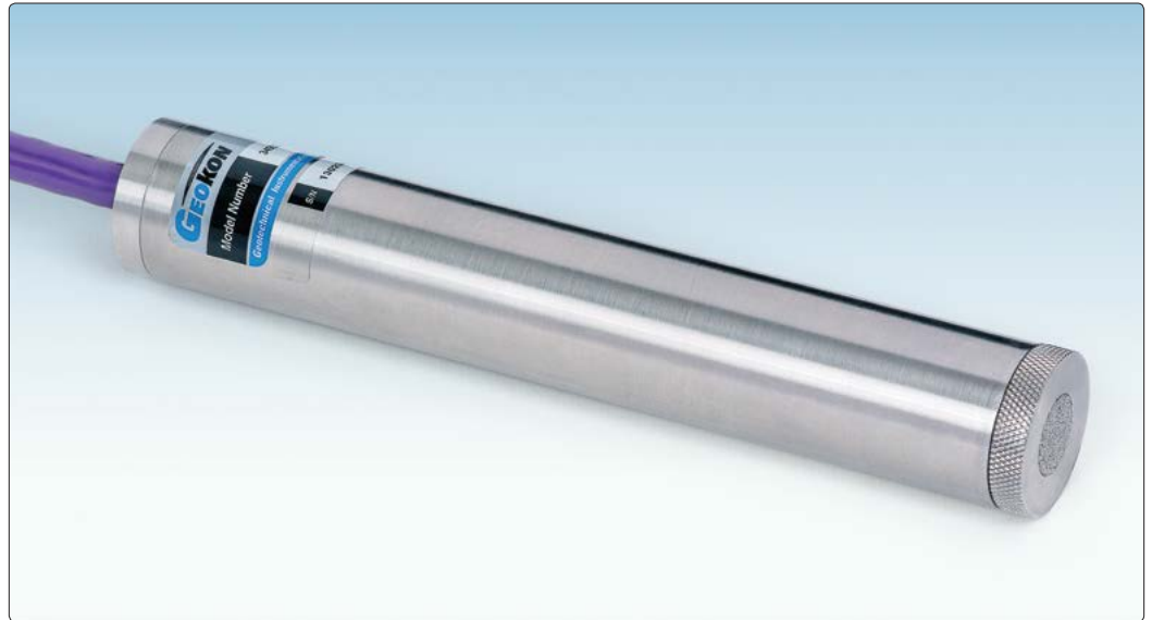
• Model 3400S-1/2 Semiconductor Piezometer.