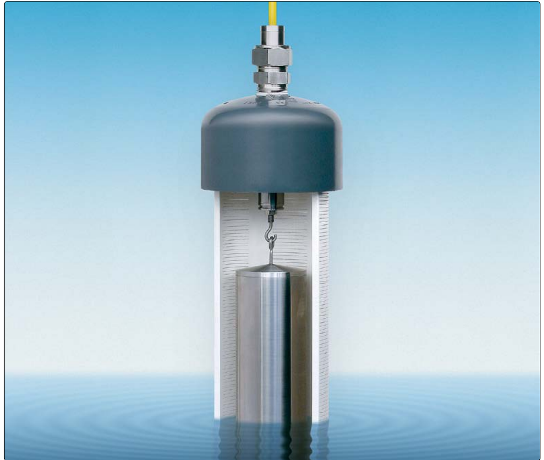
• The Model 4675LV with cutaway revealing its internal components: a cylindrical weight suspended from the vibrating wire force transducer.